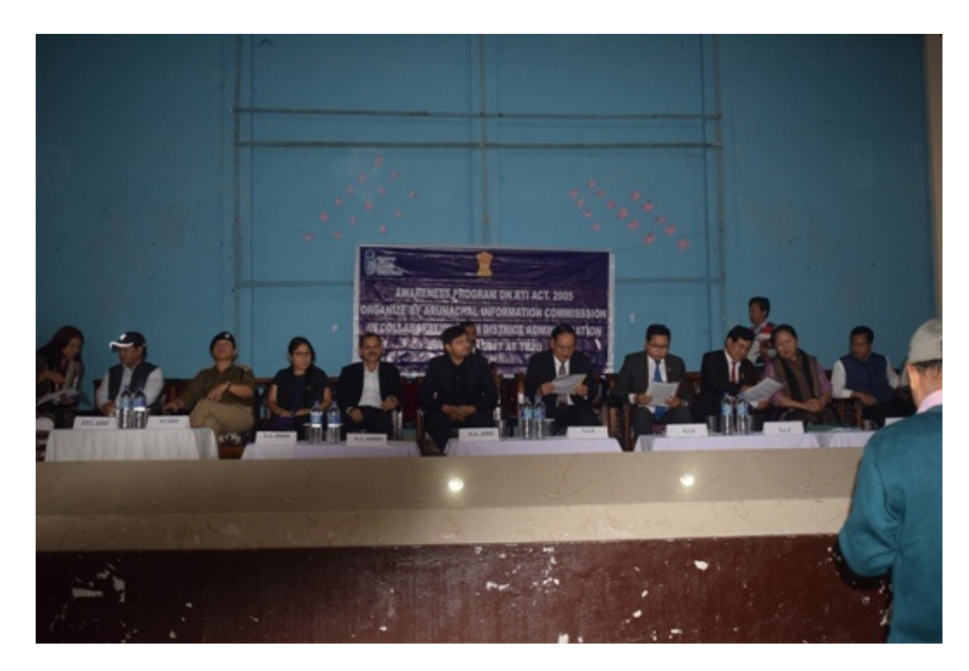
Awareness Programme on 29<sup>th</sup> March 2017 Tezu