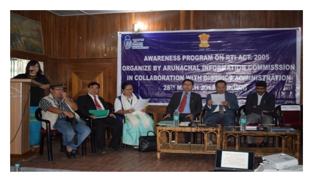
Awareness Programme on 28<sup>th</sup> March 2017 Roing