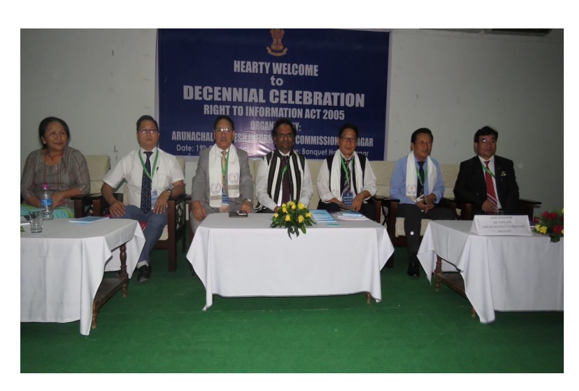
Decennial Celebration of RTI Act, 2005 on 19/10/16