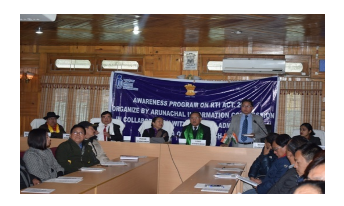
Awareness Programme on RTI Act, 2005 on Bomdila 17^{\rm th} March 2017