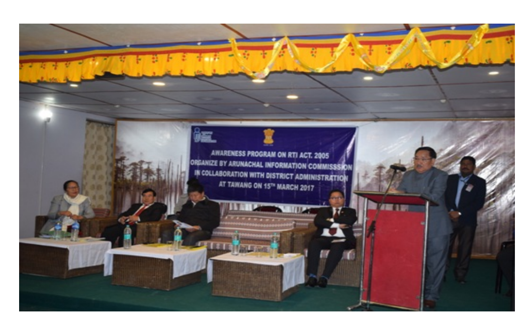
Awareness Programme on RTI Act, 2005 on Tawang 15<sup>th</sup> March 2017