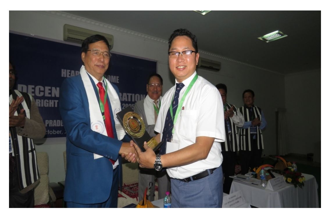
Award presented to Shri A.K. Techi SIC by Hon'ble Minister Shri T.Taga on Decennial Celebration on 19/10/2016