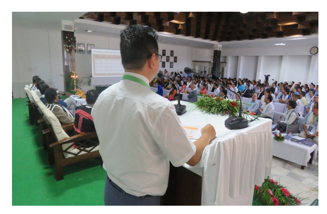
On Decennial Programme