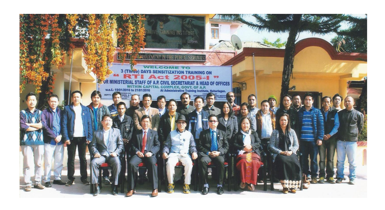
3 days Sensitization Training on RTI Act, 2005-I on 19/1/16 to 21/1/16